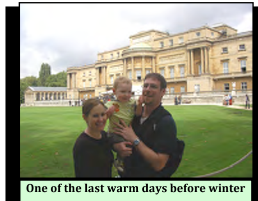
One of the last warm days before winter

It is hard to believe it is time for our next quarterly newsletter. From snowstorms, to babies, to church planting it seems like the last three months have been a little more than a blur. We have so much to catch you up on, we will try our best to make it all fit into a nice little newsletter. We hope you are warm and cozy at the moment as you enjoy the next installment of the Bear Prayer letter.